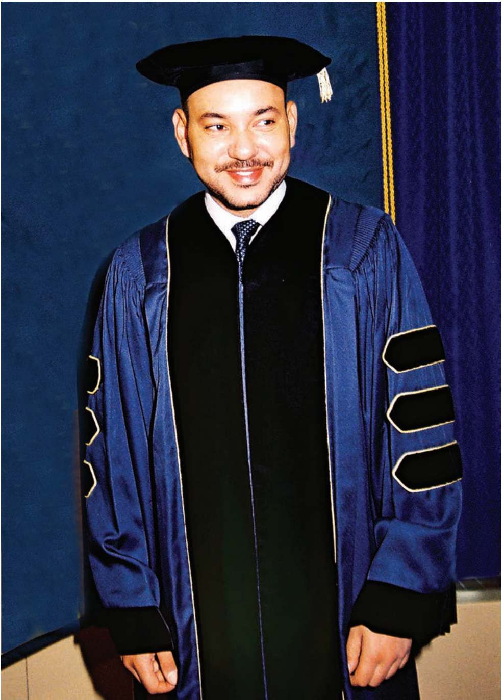
His Majesty King Mohammed VI at The George Washington University where he received an honorary degree on June 6, 2000.