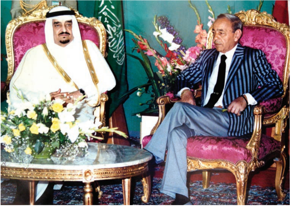
The late King Fahd Ibn Abdulaziz of Saudi Arabia and the late King Hassan II of Morocco, the University's two founding brothers (Al Akhawayn).