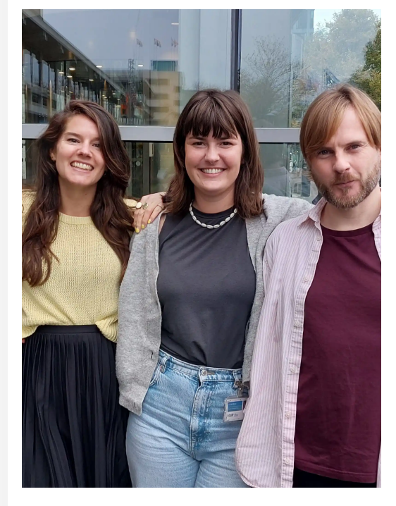
Contact and Meet the team Read more