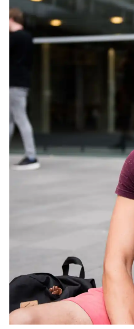
Fees and scholars Read more